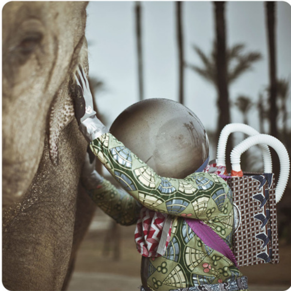
Cristina De Middel "Butungaola" from his series The Afnauts, 2012. Exhibitor Cristina De Middel:

In its third edition, the renowned art fair created in 1996 dedicated to historic and contemporary photography, will present more than 70 galleries in a unique space that will allow thousands of visitors to experience and discover contemporary art in a dynamic way. This time of 1 to May 3, originating from 17 countries meet to explore the use of photography and the moving image.