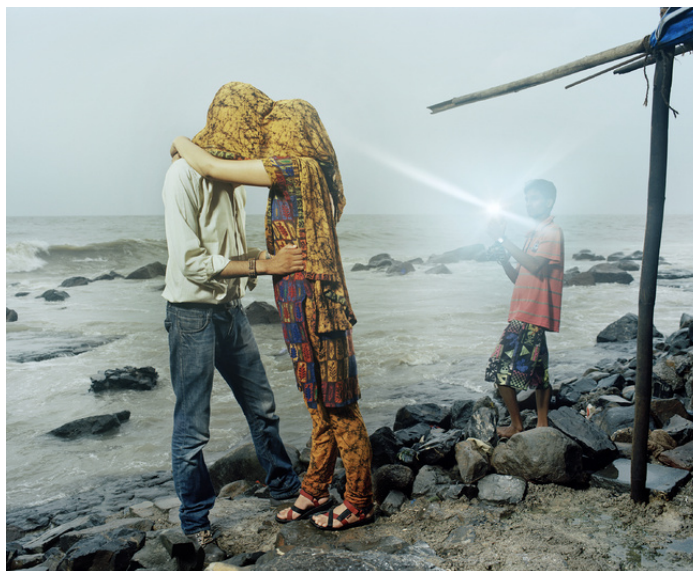
Max Pinckers "Zinagi" the Will They Sing Like Raindrops or Leave Me Thirsty, Series 2014 digital printing. Display: Dillon Gallery

The best overall photograph meets in California.