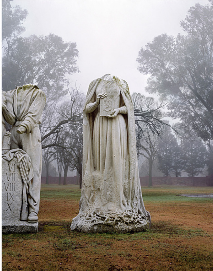
Santiago Porter Evita, The Veiled II series 2008 Photography. Display: ROLF ART