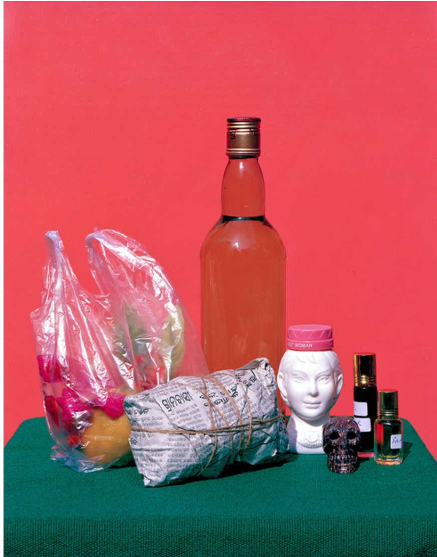
Home Remedy Joaquin Trujillo (India), 2012. Exhibitor: De Soto Gallery